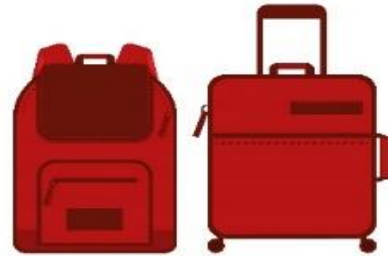
BAGS AND SUITCASES