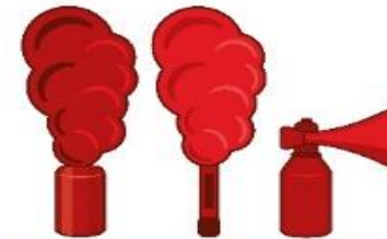
SMOKE CANISTERS/FIREWORKS/FLARES AND AIR HORNS