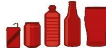
DRINK CARTONS, CANS, PLASTIC BOTTLES OVER 500ML, GLASS BOTTLES AND DRINKING GLASSES