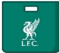
RETAIL PURCHASES IN RETAIL CARRIERBAGS