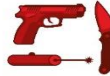
KNIVES/WEAPONS AND LASER DEVICES